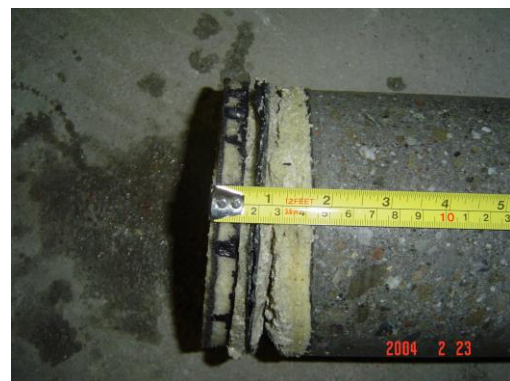
Injection grout on both sides of the bentonite paneling