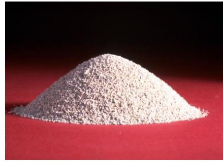
Sodium Bentonite Granules

Bentonite was formed from volcanic ash deposited in an ancient sea where it was modified by a geological process into sodium bentonite. Bentonites were calculated to have accumulated between 70 and 74.5 million years ago. At that time, the area was the center of a huge shallow inland sea stretching from the Arctic Ocean to present day Mexico and was nearly a 1,000 miles wide.