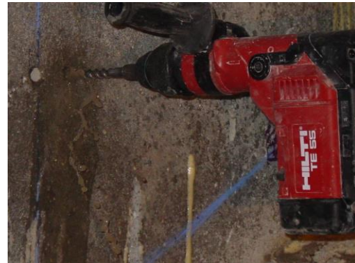
5/8” Zirc Fitting drilling through 18” foundation wall

The repair included drilling 5/8” diameter holes in four feet on center grid formation through the 18” shotcrete foundation wall. Several types of hydro-active grouts were injected through the holes to reach behind the foundation walls. Upon contact with water, the grout quickly expands and cures to form a water barrier behind the entire surface of the wall and under portions of the slab. The grout