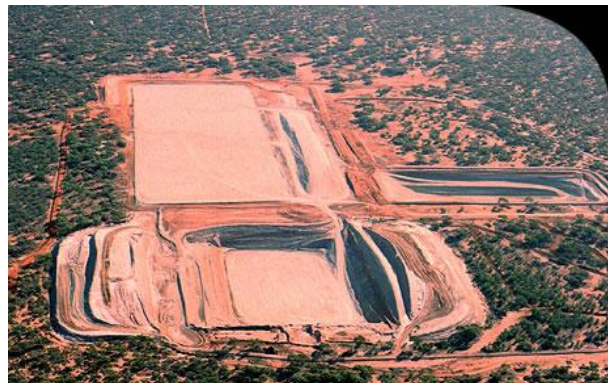
Sodium Bentonite Mining Quarry

Mining of bentonite is much different from traditional mining methods. The process allows the reclamation of the mining site to be restored to its near original condition making this an acceptable product for sustainable building. Before mining bentonite can begin, a detailed plan for extracting the mineral is developed by drilling and sampling. Once the area and depths are defined, mining begins by removing the overburden from the mineral deposit with large earth