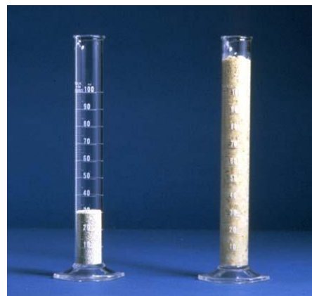
Sodium Bentonite Expansion Dry/Wet

Sodium bentonite expands when wet, absorbing up to eight times its dry mass in water, which gives it tremendous sealing properties. Sodium bentonite has been called the clay of a thousand uses. It contains exchangeable sodium cations, which are positively charged ions that attract the cathode in electrolysis. When the cations are dispersed in water, they separate into plate-like particles, which are negatively charged on the surface and positively charged on the edges. This unique ion exchange relationship is responsible for the expansion, binding or absorbing action that takes place. Bentonite's small plate-like particles provide a tremendous potential for increasing surface area. It forms thixotropic gels with water even when the amount of bentonite is relatively small. Modern chemical processes can modify the ionic surface of sodium bentonite dramatically intensifying the