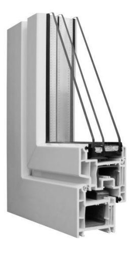
Figure 1A – Vinyl Windows

Windows are one of the most complex and expensive facets of the building envelope as they can account for approximately 10% of a building's air infiltration according to the U.S. Department of Energy, and can cost up to several thousand dollars per unit. The number, size, material choice and orientation of windows can make or break the energy efficiency of the entire building. With so much on the line, it is important for windows to be weather and water tight. There are slightly less than 100 different American Society for Testing and Materials (ASTM) tests and 40 American Architectural Manufacturer's Association (AAMA) standards, in addition to various other NFRC, ANSI, ASCE, CPSC, NFPA, UL and GANA Standards pertaining solely to windows. One of the most specified glazing products in multi and single family construction is the vinyl window.