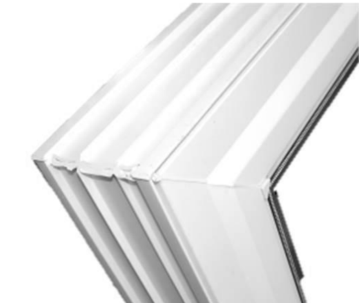
Figure 2B– Common Window Failures

Mulling windows has its inherent risks and issues as well, as mulled joints are a very common area for water intrusion. Because fixed mullions are not flexible unlike the vinyl frames, they do not move with the vinyl window frame and they can crack due to temperature changes resulting in a vertical mulled failure. Mullions and capping trim attachments need to be continuously sealed to the exterior of the window to be effective. Sealant also needs to be applied between the mullions to effectively prevent leaks. Also, we have noticed several examples when screws are driven into the window from the interior during the mulling process, which is another big source of leaks. One of the advantages of vinyl windows is having a continuous welded frame and welded fin; however, mulled windows do not have continuous welded fins often resulting in leaks at