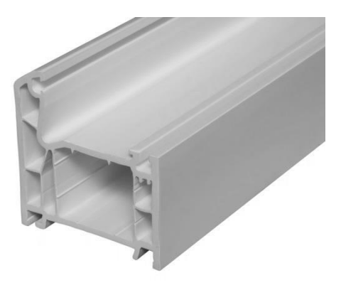
Figure 1B – Vinyl Windows