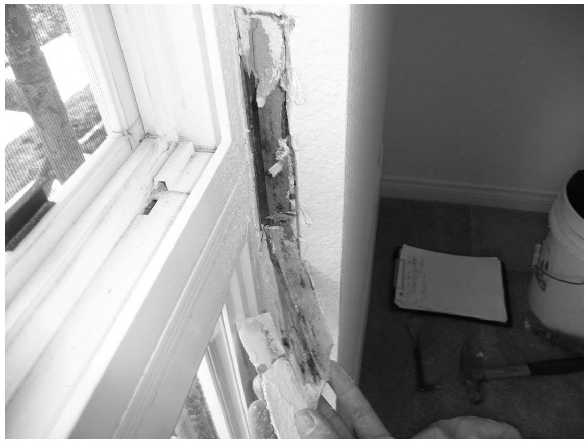
Figure 3A – Vertical Mullion Failure

the joints between fins. Even if individual windows are tested and deemed successful, if the mulled window is not tested as an assembled unit, it can be susceptible to failure at the mulled joints from the lack of windows' welded fins. Many manufactures and builders fail to test windows in the actual mulled configuration, resulting in water and air intrusion issues down the line.