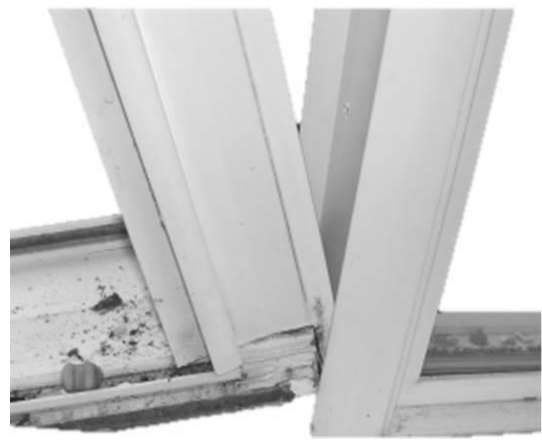
Figure 2A – Common Window Failures

Vinyl is a relatively flexible material making it weak in bending strength. vinyl windows in a larger size are generally not available since the frame lacks the stiffness and rigidity to support a large piece of glass. They are more effective for smaller windows, but sometimes longer span vinyl frames are reinforced with steel to reduce bending and bowing of the frame, which can result in reduced thermal performance. Flexibility and excessive bending make it more difficult for sealants and glazing gaskets to uniformly and effectively attach resulting in air leaks and water infiltration, as shown in Figure 2A. Vinyl window mullions are not as strong as aluminum therefore, larger mullions are required to span the same sized window as compared to aluminum or steel. To overcome the lack of larger vinyl windows, often several windows, usually 2 to 3, are mulled, or joined together, to form a larger window.